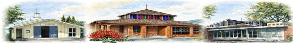
St Joseph's Orakei