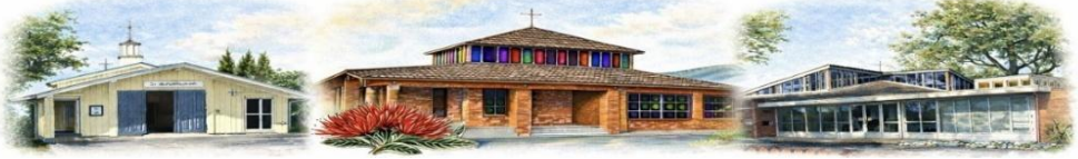
St Joseph's Orakei