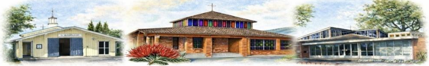
St Joseph's Orakei