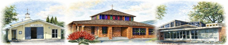
St Joseph's, Orakei